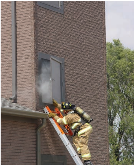
The fire training tower is filled with simulated smoke during a training drill requiring firefighters to locate and extract a victim.

The building’s construction and features also make it a good fit for training by other agencies such as the Police and Sheriff’s Departments. For example, the steel and concrete construction offer law enforcement personnel the perfect setting to safely practice S.W.A.T. and tear gas training without fear of damaging the structure.