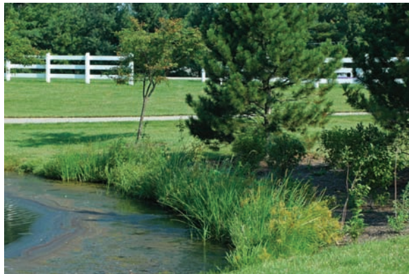
Shoreline plantings help control erosion of the Homestead's pond edge.

These plantings will continuously be evaluated and expanded until sufficient erosion control is established.