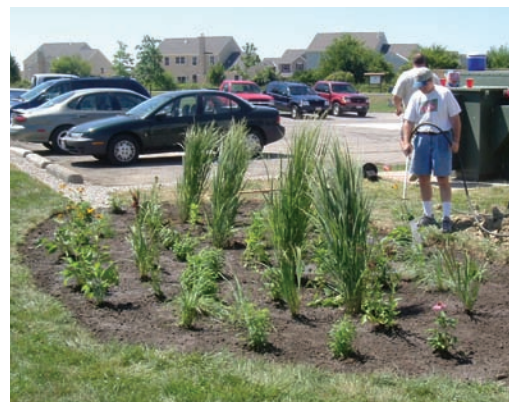
A rain garden is planted near a parking lot to help capture, slow, and filter runoff.

In an area adjacent to a paved parking lot at Homestead Park, a rain garden was established to provide an area where the water that flows over the pavement can be slowed and naturally filtered before entering the water shed.